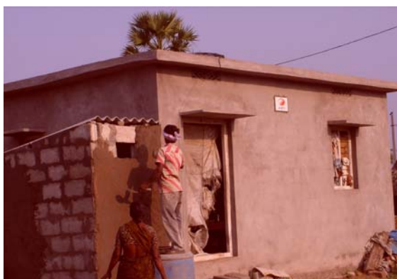
Construction work under the observation and delight of the owner of this gift.

House constructions for the Tsunami victims were undertaken in two phases. The 1st phase 37 houses and in the second phase 40 houses. 37 houses were constructed around Manginapudi beach. 40 houses at Usualavari-palam of which 23 are for the people belonging to the Scheduled caste and 17 for the Scheduled tribe's