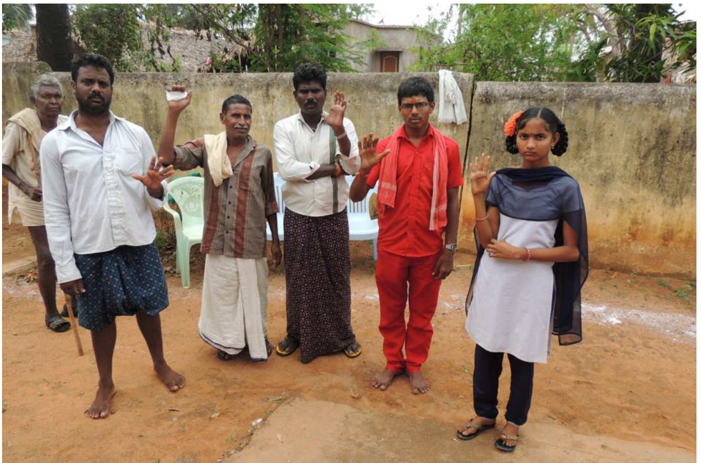
Above : Persons affected by Leprosy related deformity of the hand, post their successful reconstructive surgery.