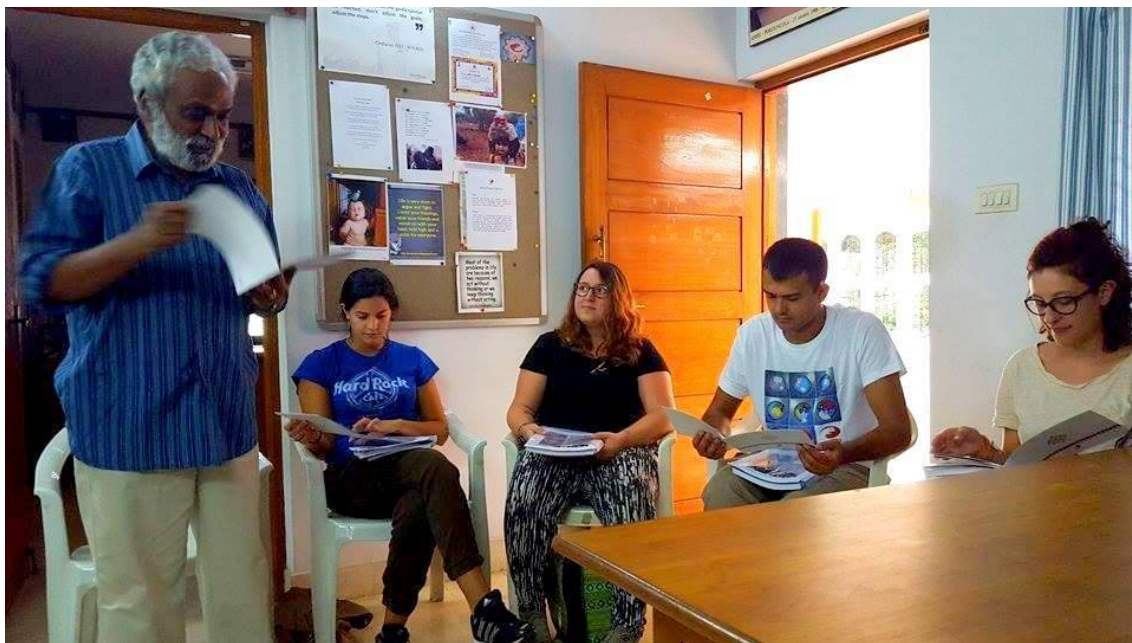
Above: 4 Italian students who came to India, to participate in an exposure visit at AIFO India's project in Malavalli